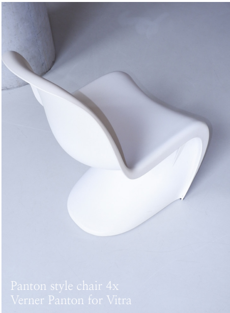
Panton style chair 4x Verner Panton for Vitra