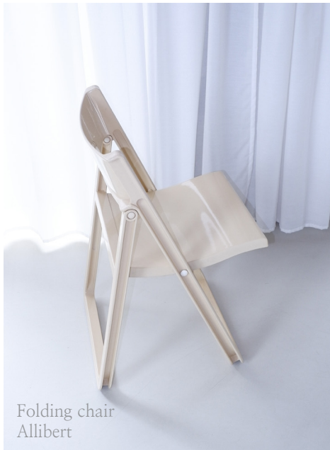
Folding chair Allibert