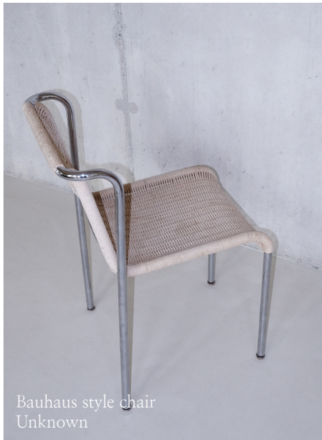
Bauhaus style chair Unknown