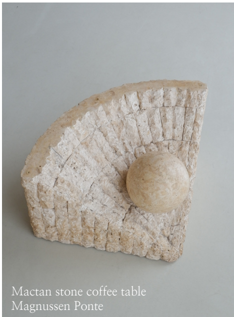
Mactan stone coffee table Magnussen Ponte