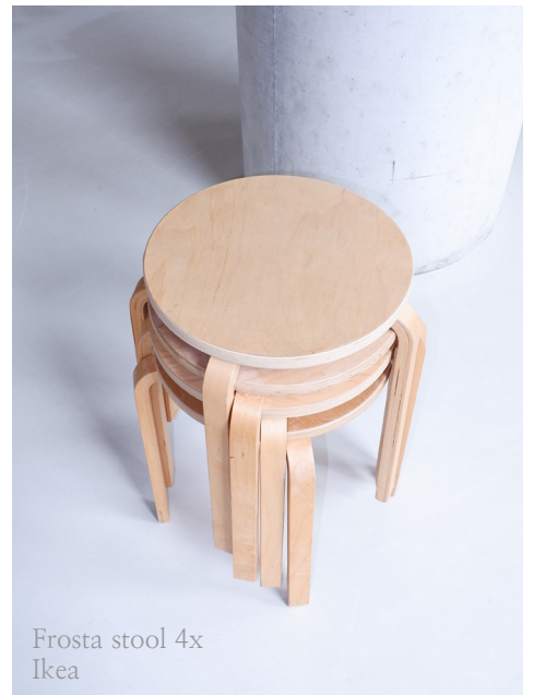
Frosta stool 4x Ikea