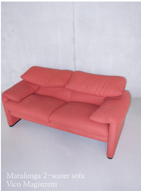
Maralunga 2-seater sofa Vico Magistretti