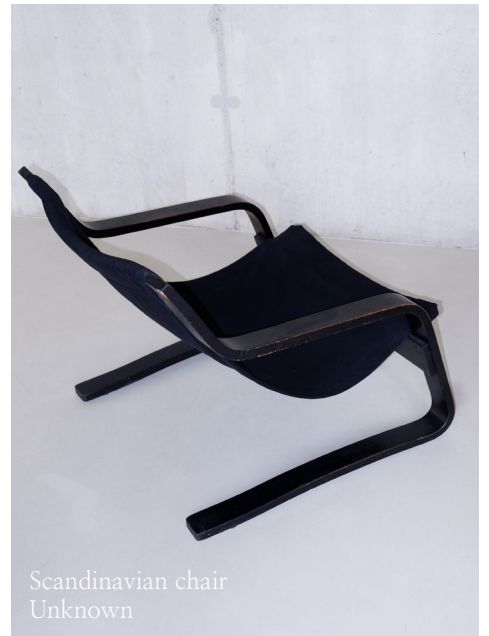
Scandinavian chair Unknown