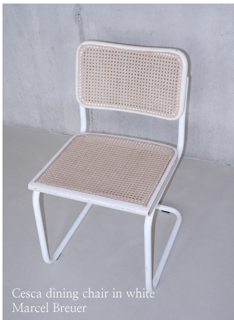
Cesca dining chair in white Marcel Breuer