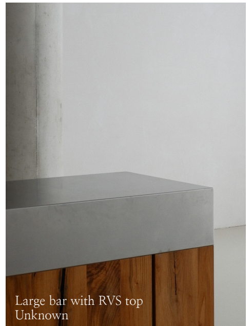
Large bar with RVS top Unknown