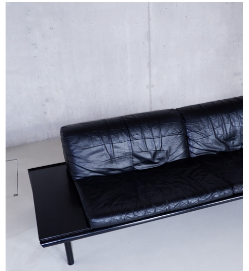
The Mission sofa Harvink