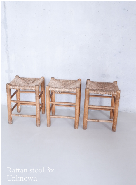
Rattan stool 3x Unknown