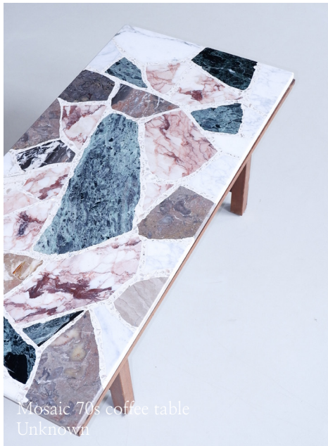
Mosaic 70s coffee table Unknown