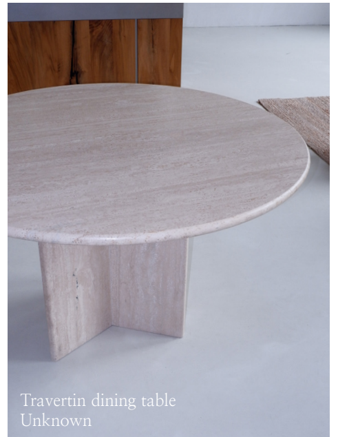
Travertin dining table Unknown