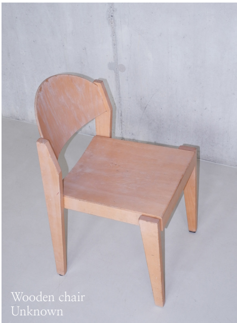
Wooden chair Unknown