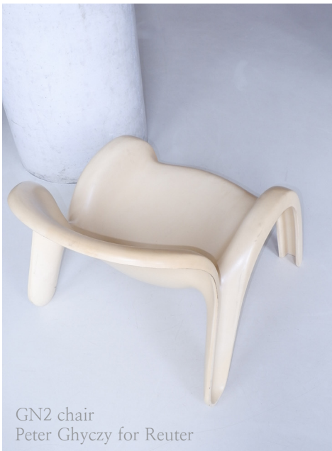
GN2 chair Peter Ghyczy for Reuter