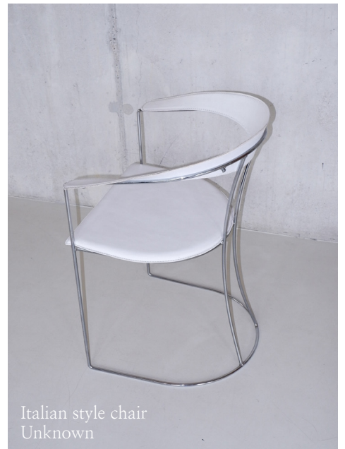
Italian style chair Unknown