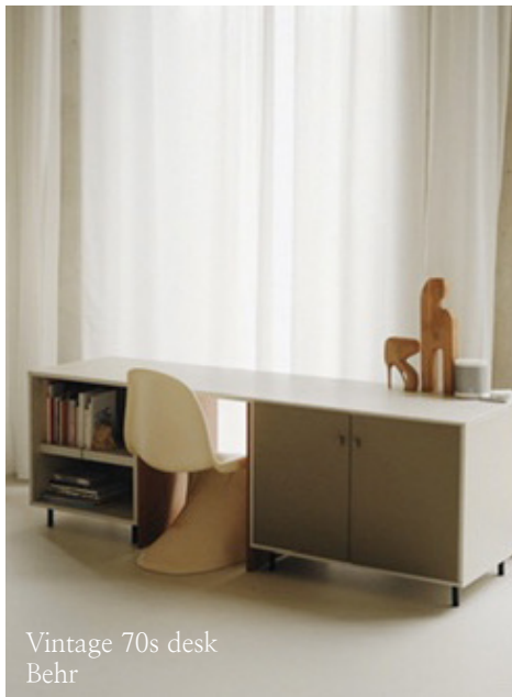
Vintage 70s desk Behr