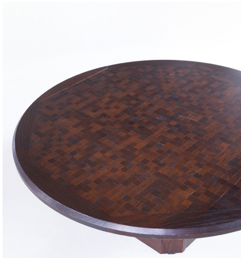
Balinese coffee table Unknown