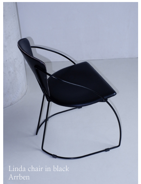
Linda chair in black Arrben